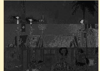
St. Anne's teens gather together to pray by the Eucharist during Adoration.

In the future, we hope to schedule similar events, led by our newly formed youth band. Keep your eyes opened for this upcoming event in the next few months.